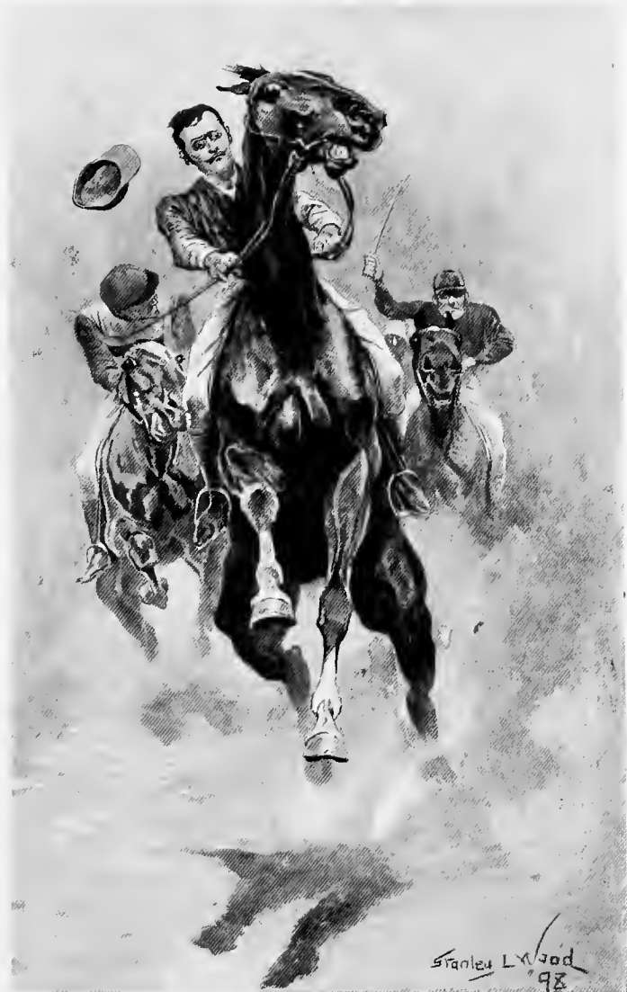
“Saraband bounds forward into the air.”